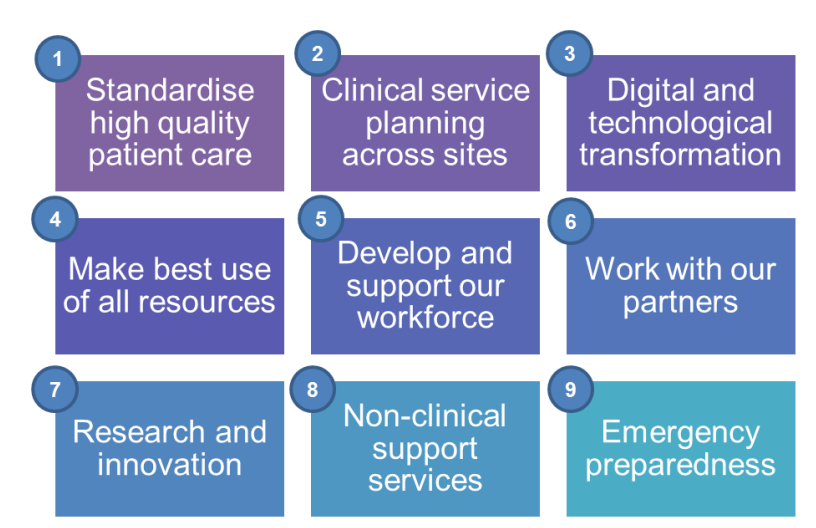
Figure 1: UHB's nine strategic themes from the multi-year strategy

A robust strategy setting and planning process is crucial to help the Trust achieve its long-term goals. It helps us identify the choices we are making and how we are prioritising our limited resources and helps staff to shape and understand the organisation's direction and their role in this.